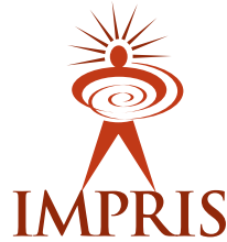
IMPRIS, LLC. Centralized Database Management