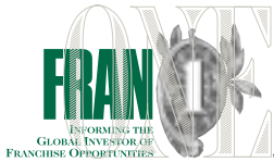
PR One, LLC. & FRAN One, Inc. Investment Firm and Franchise Advisor