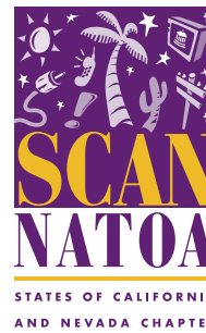
SCAN NATOA Non-Profit Telecommunications Organization