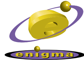
Enigma Entertainment Video Duplication Services