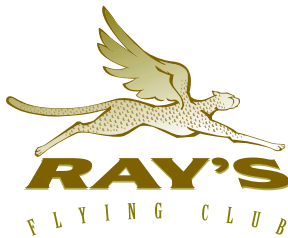
Ray's Flying Club Grumman Flight Instructor School