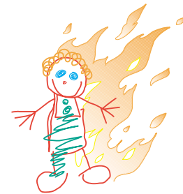
A Child's Nightlight Public Service Message Identity for the Prevention of Child Abuse