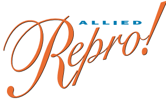
Allied Reprographics, Inc. Flexographic Prepress House