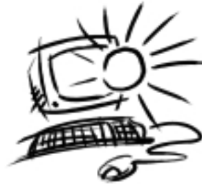
Colorado Online School Consortium Non-Profit Distance Education Organization