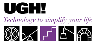
UGH! Productions Dynamic Software Development Company