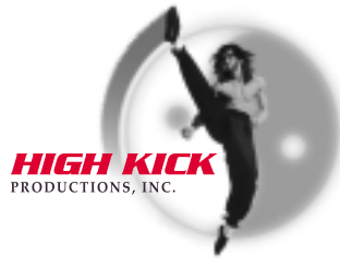
High Kick Productions, Inc. Martial Arts Action Film Choreographer