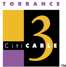
City of Torrance CitiCABLE3 Community Cable Television Channel