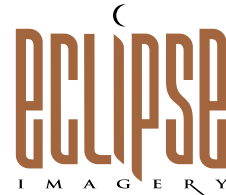
Eclipse Imagery Photography Studio