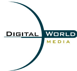
Digital World / Media Multimedia Developer